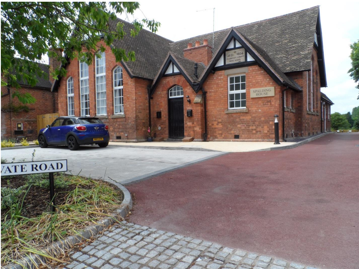
New Spalding House